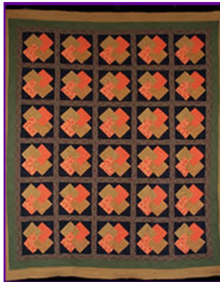
Exhibit: Thurs.-Sat., Sep. 13 - 15 Lecture: Saturday, September 15, 10:30 AM